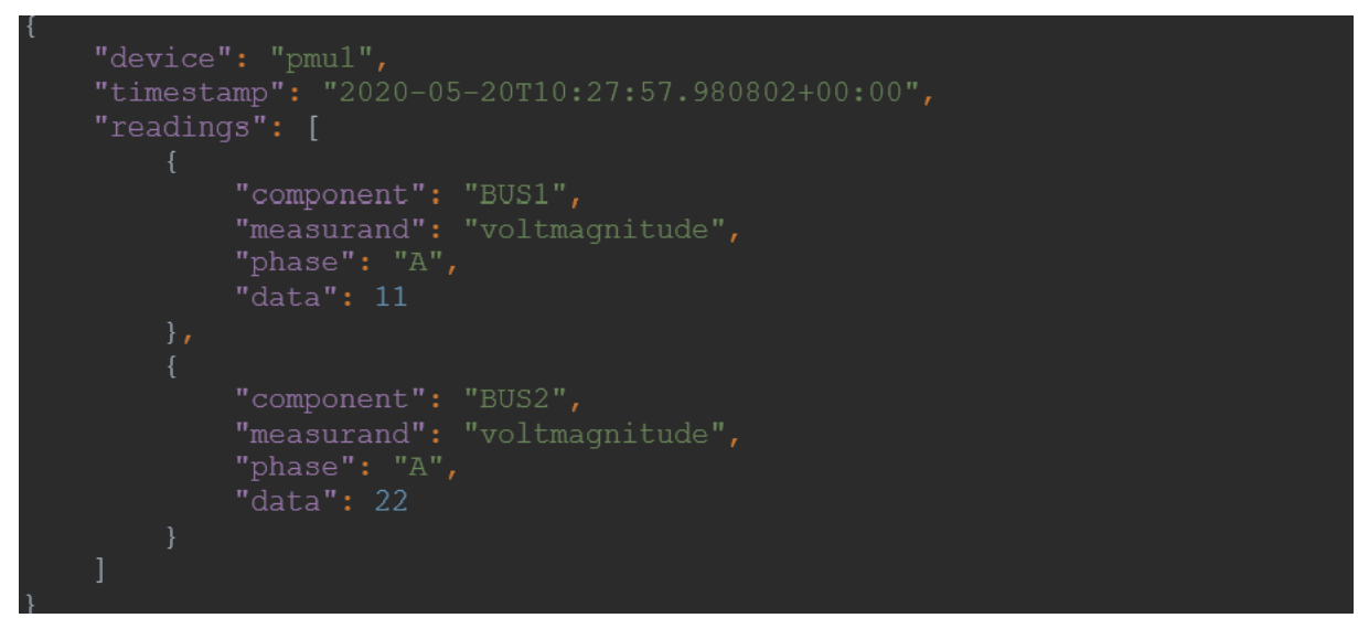
Figure 4: PMU Reading Data Model